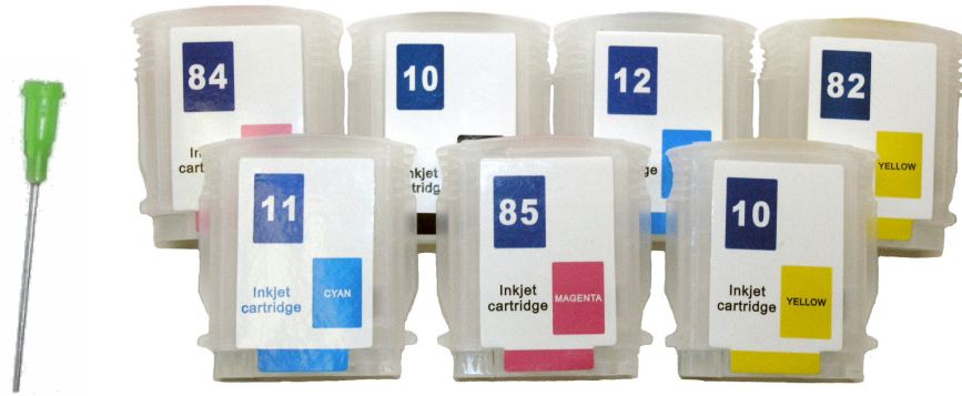
1 ½" Needle Clear Refill Friendly 10, 11, 12, 82, 84, and 85 Empty Cartridges